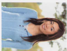
Using external flash

Easy to install on camera by the attached bracket.